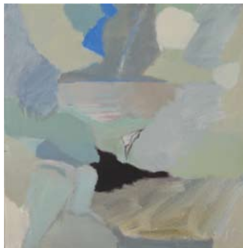
Coast Song 3 2010