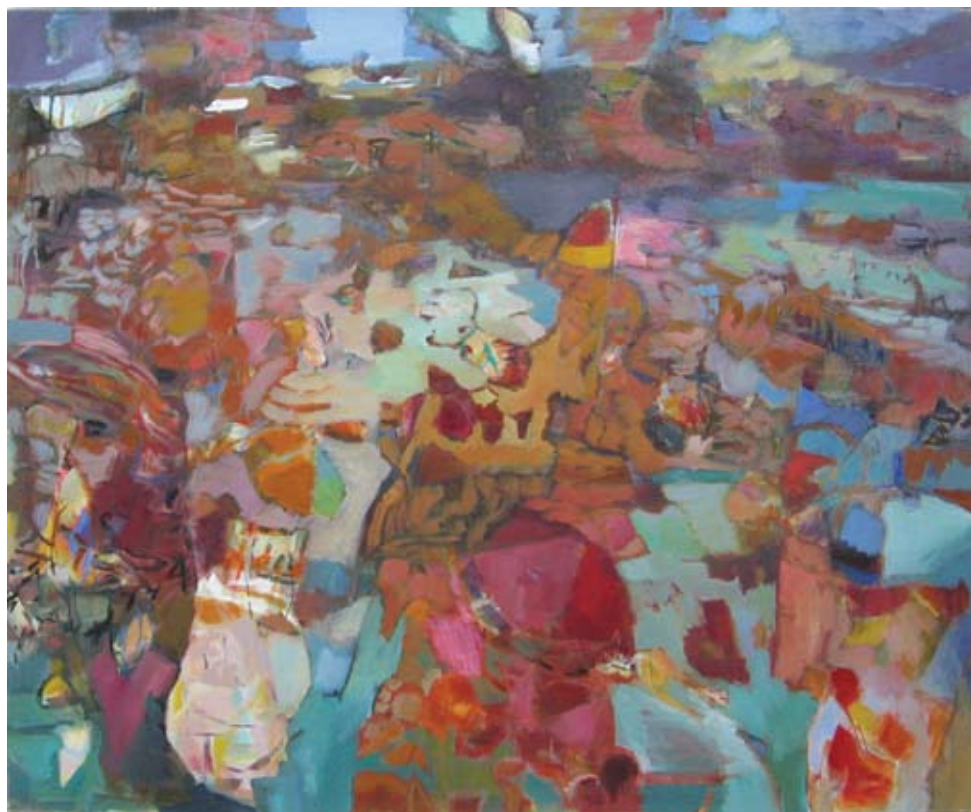
Beach Umbrella 2005