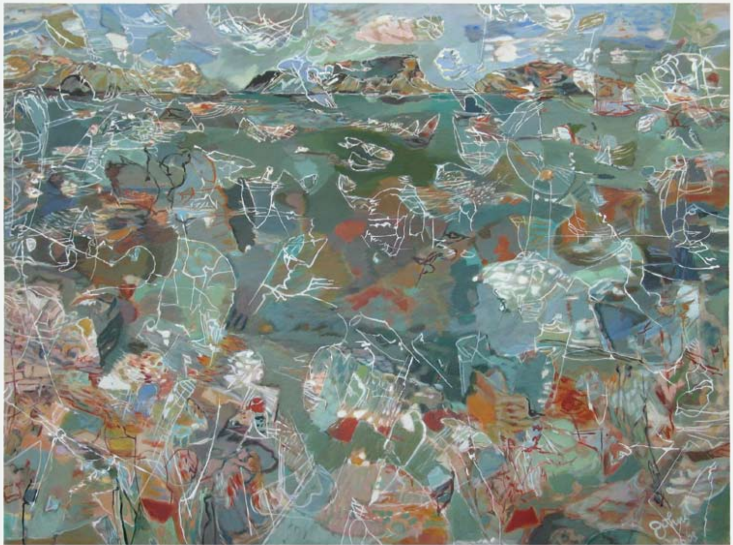
Storm Bay 2008