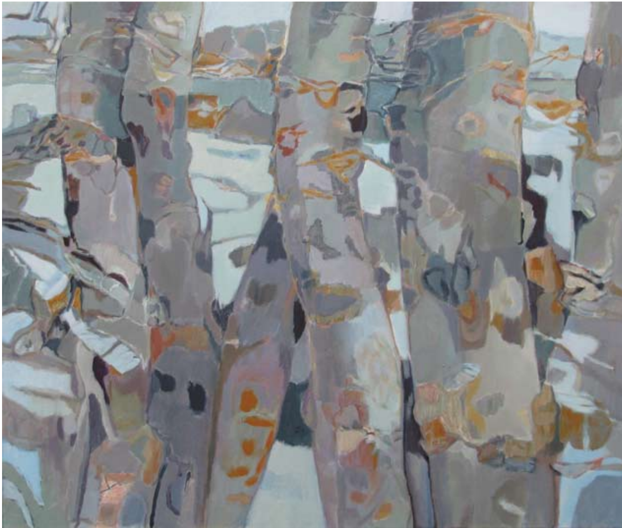
Light and Water 2010