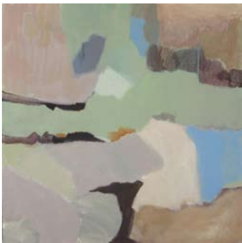
Coast Song 2 2010