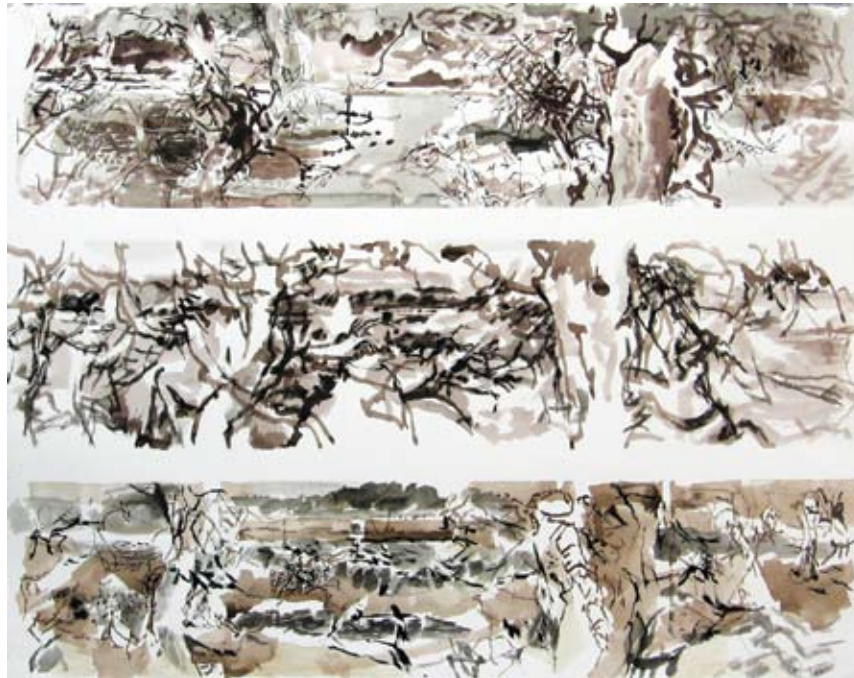
Across Tomaga Creek 2007