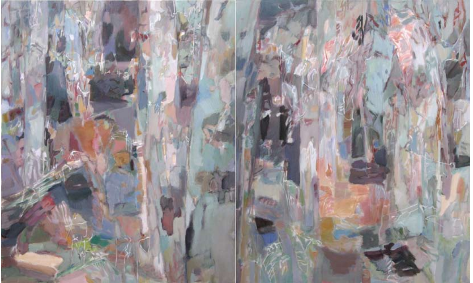
Southern Forest 2006