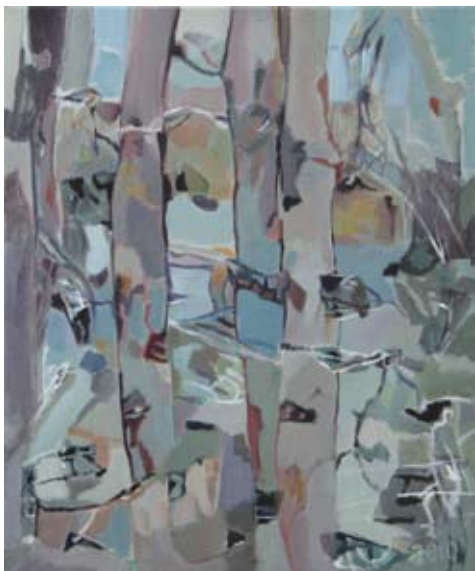
Little Forest 4 2010