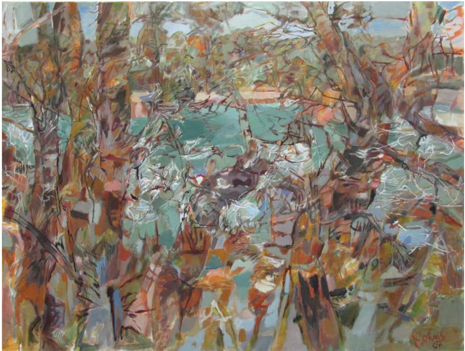
Dark River 2007