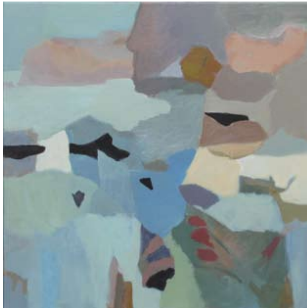
Coast Poem 4 2010