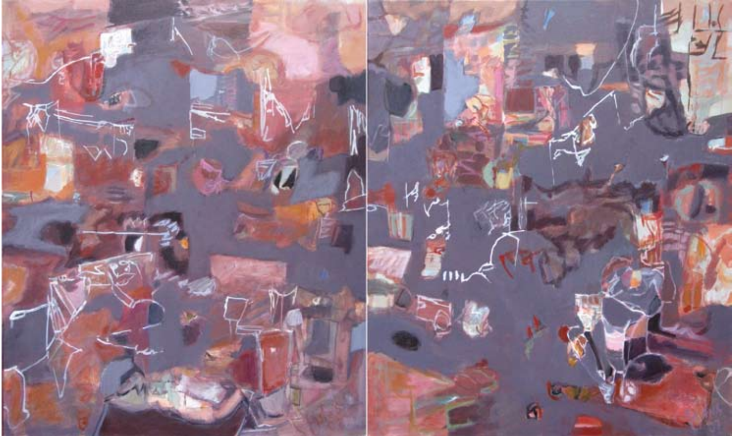
Night Spaces 2007