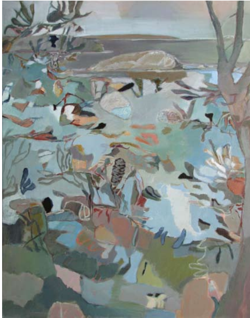
Guerilla Bay Banksia 2010