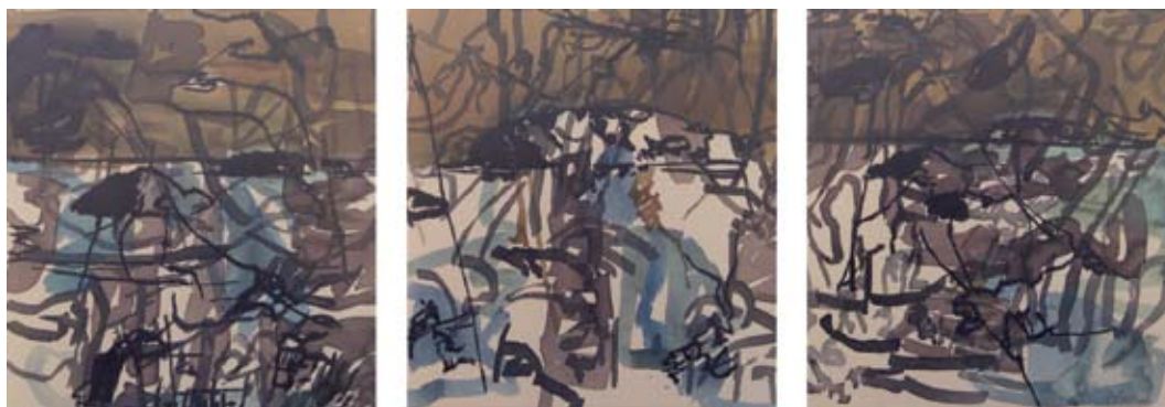
Islands Triptych 2006