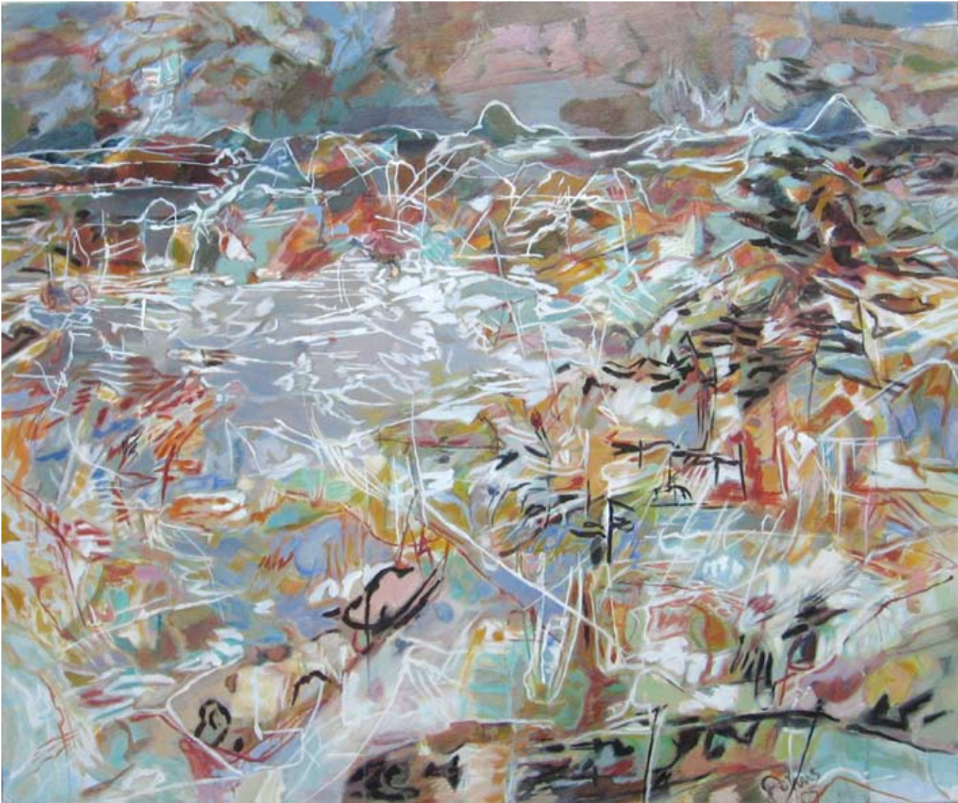
Storm Coast 2005