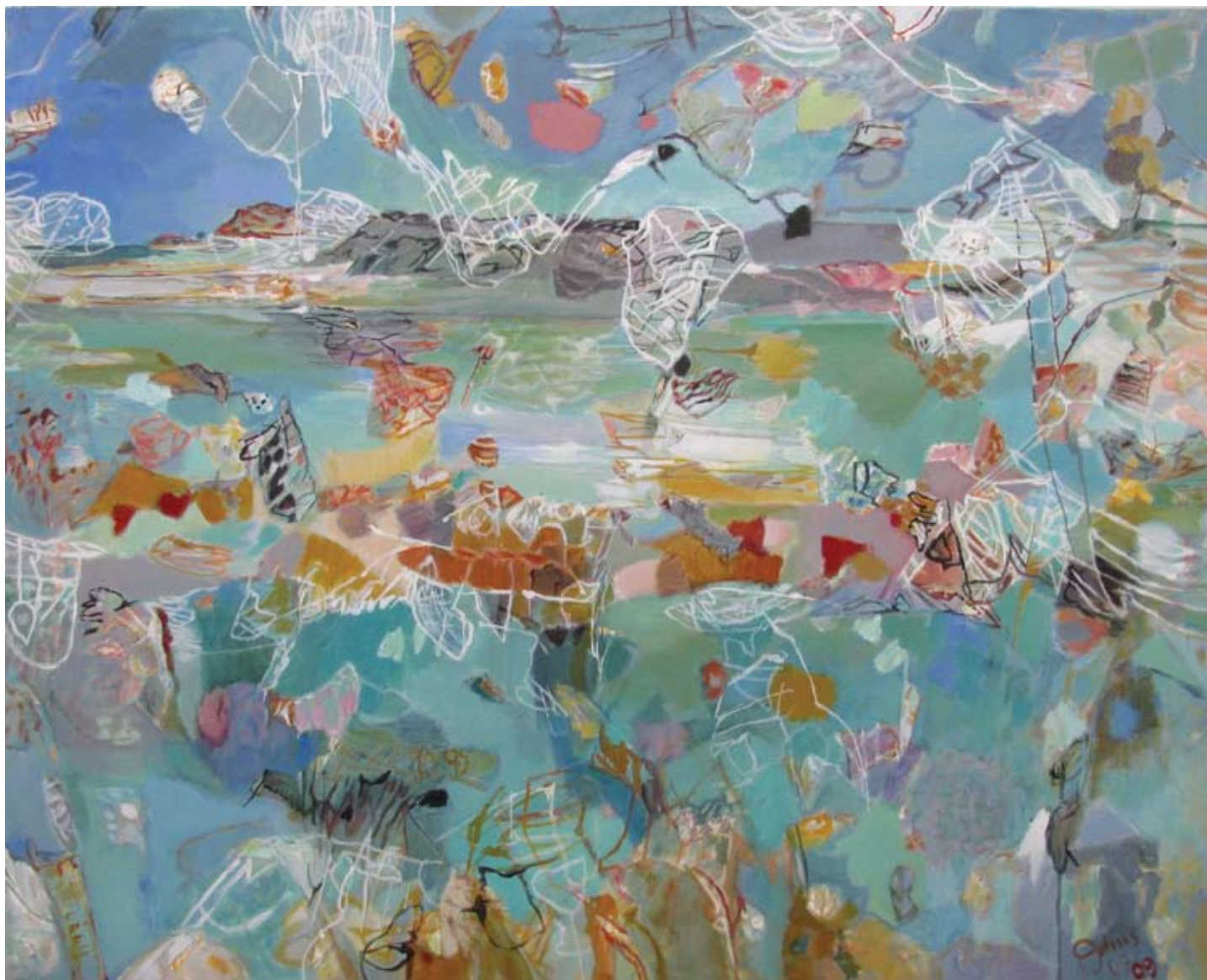
Tuross Sun and Shade 2009