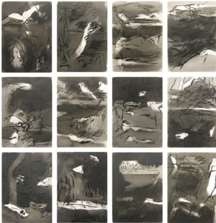
Night Shore 2005