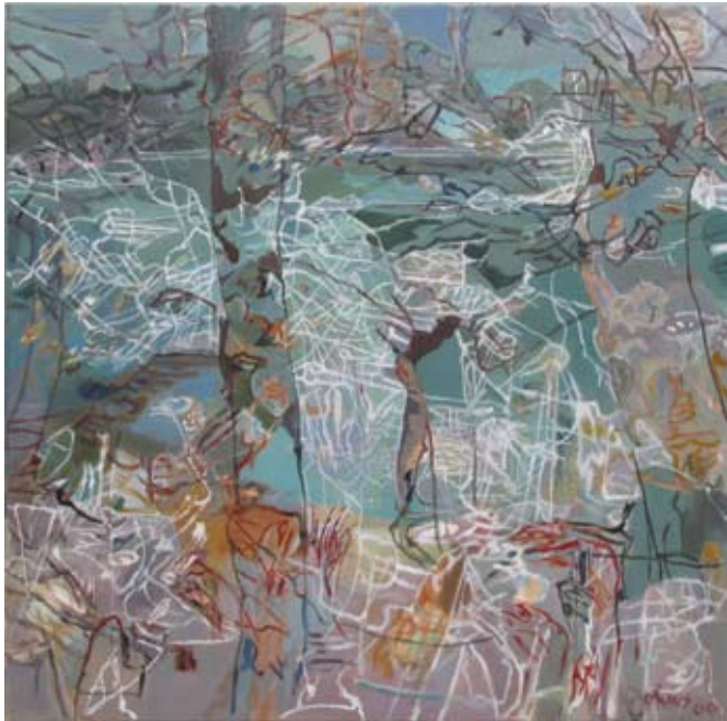
Before Water I 2009