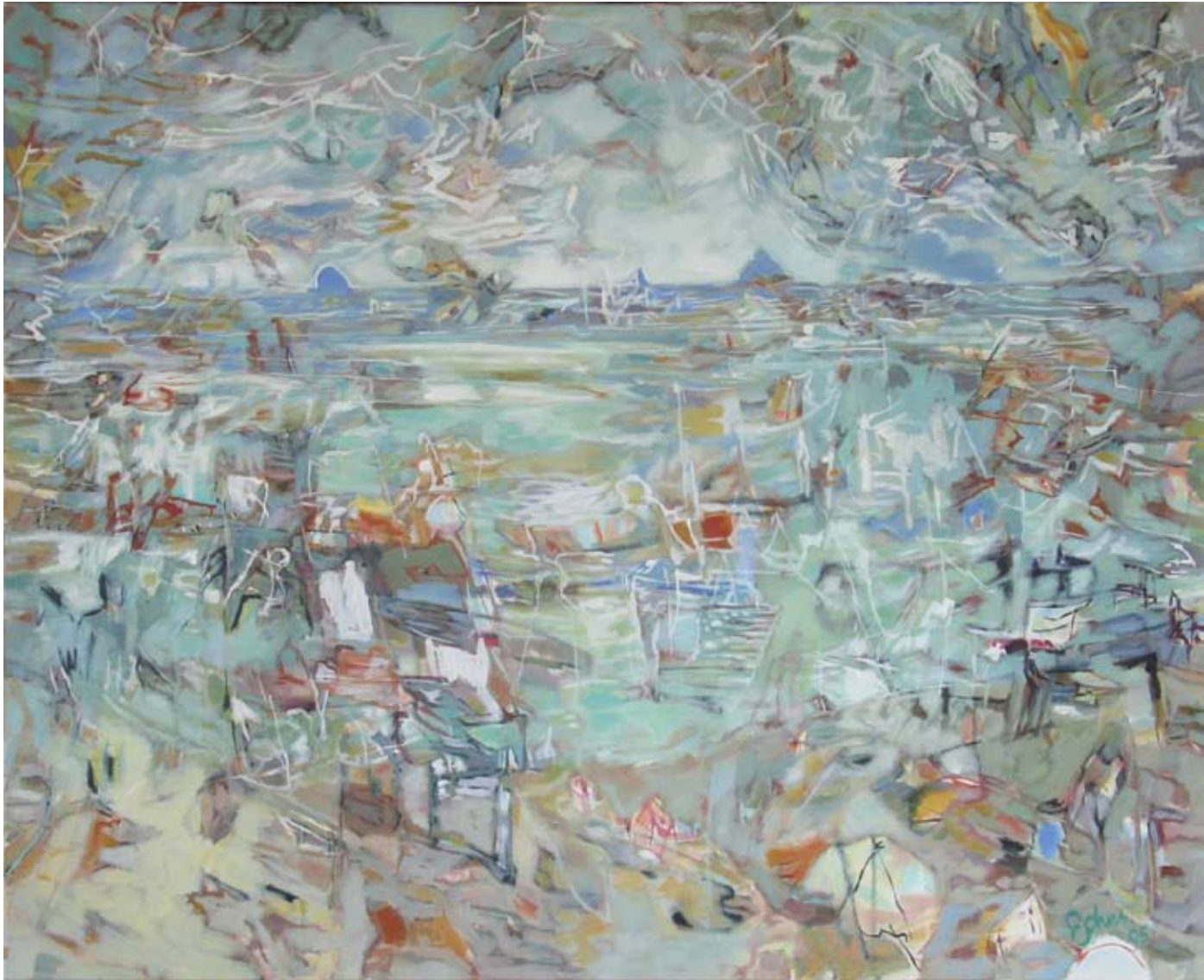
Calm Passage 2005