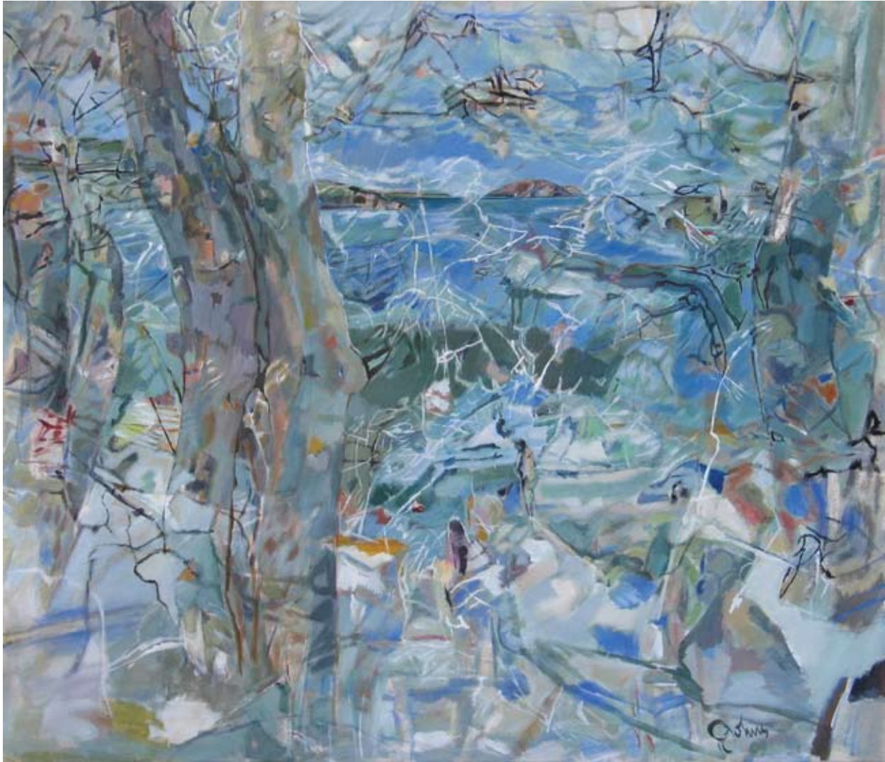
Figure and Island 2009