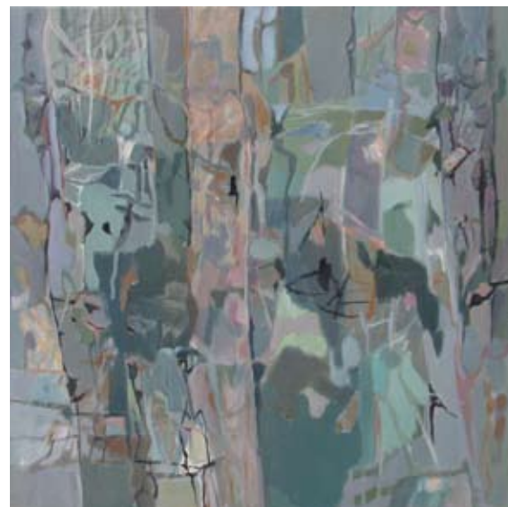
Little Forest 3 2010