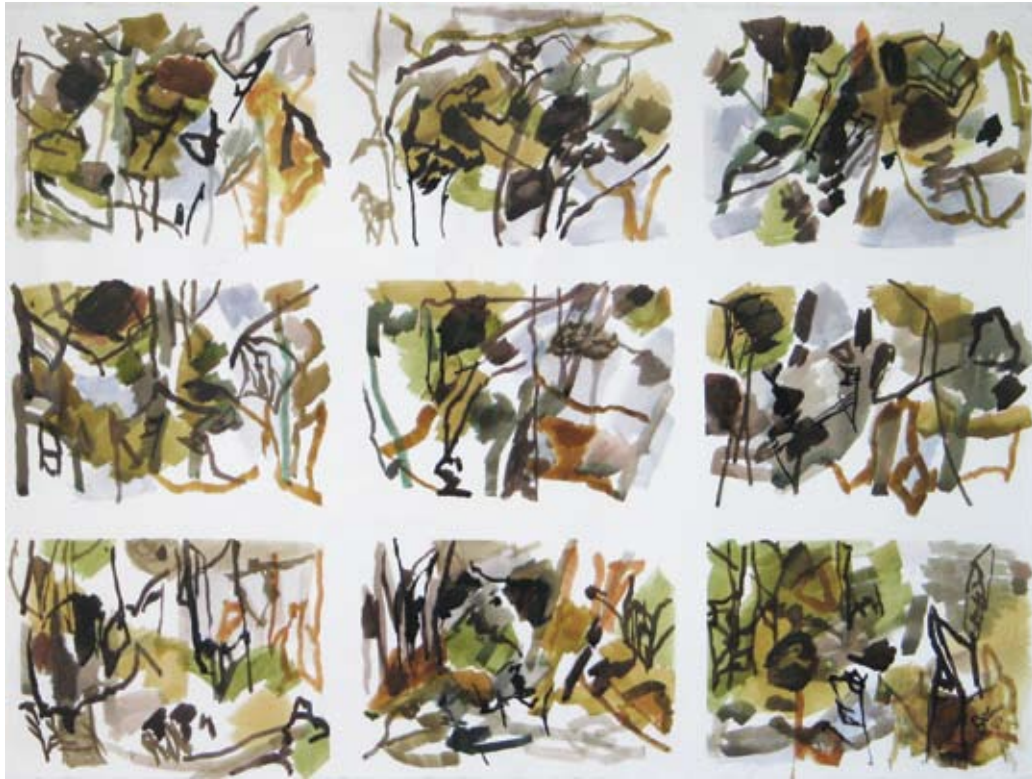
Forest Drawings 2007