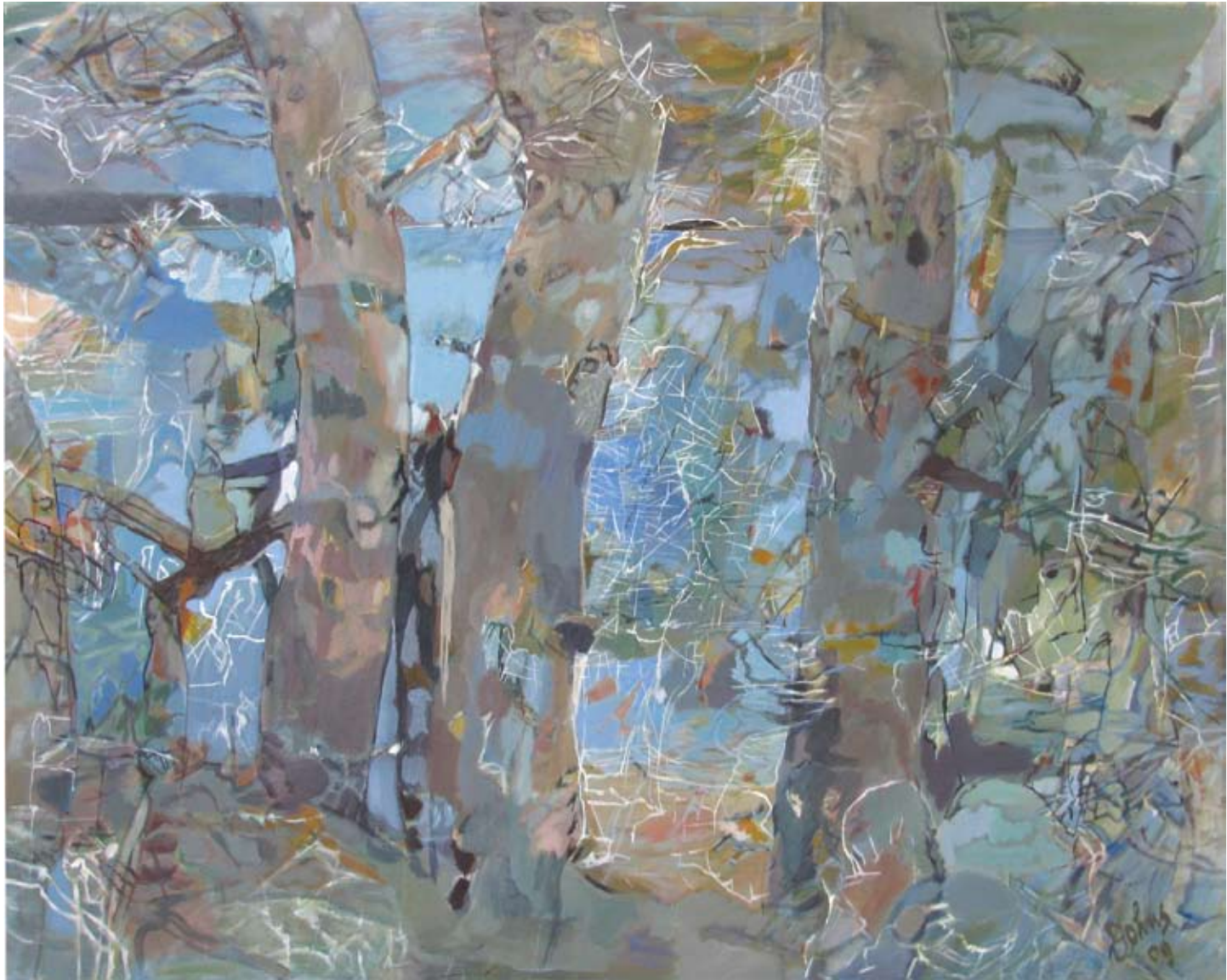
Tollgates Through Trees 2009