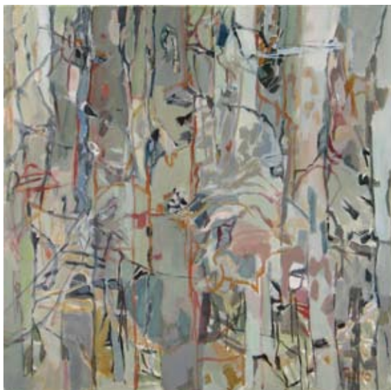
Little Forest 2 2010