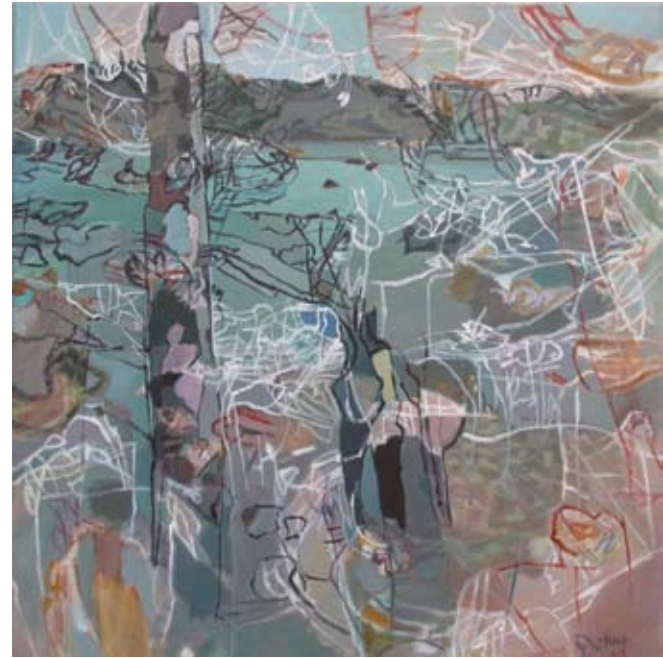
Before Water II 2009