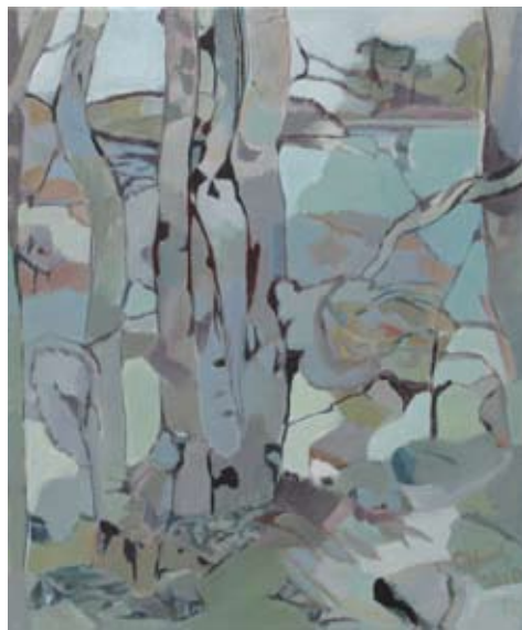
Little Forest 5 2010